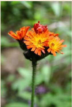
Fox and Cubs

Have you spotted a flower that isn't shown?