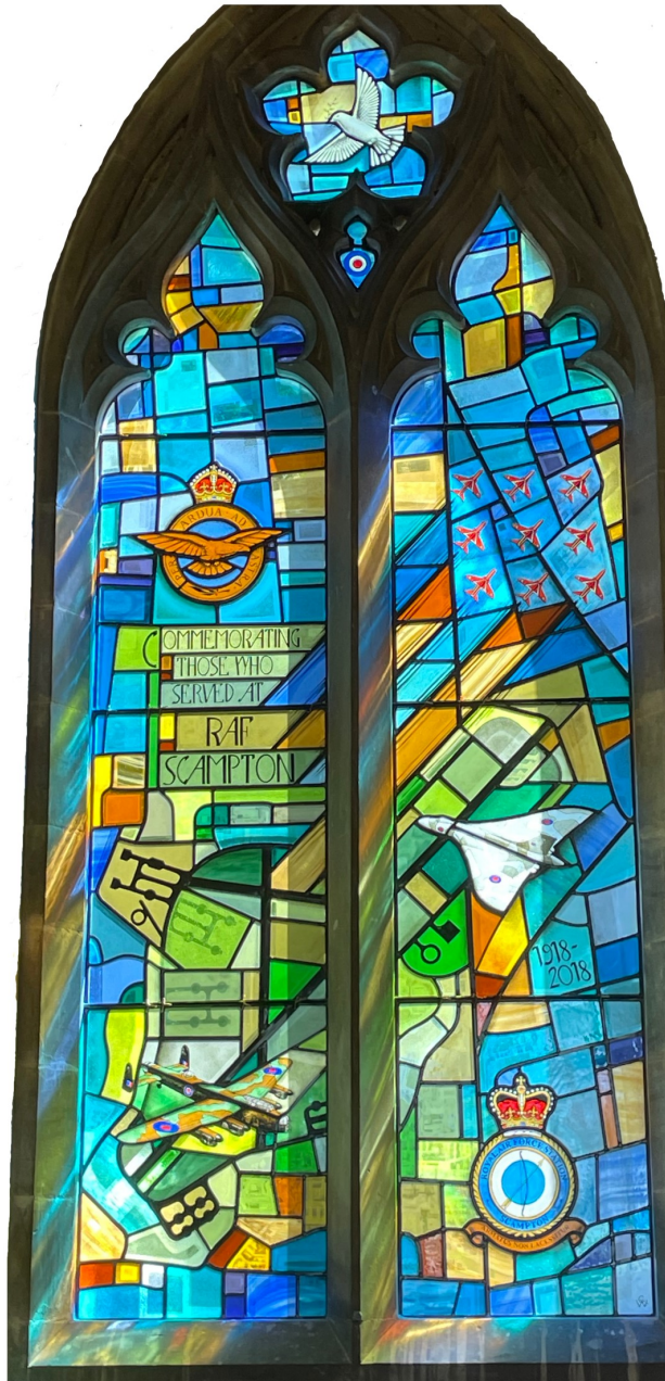
RAF Scampton Commemorative Window