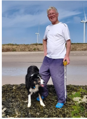
"Let's work the beach Arrow"